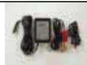
Battery Fighter® Junior